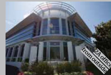
2A office from outside