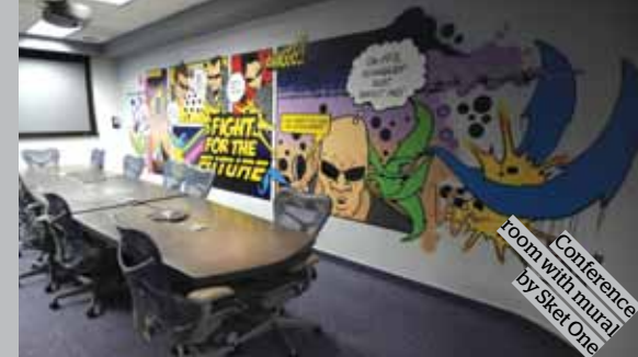
Conference room with mural by Slet One