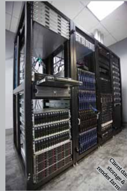
Client data storage & render farm