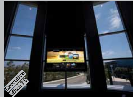
Executive office TV